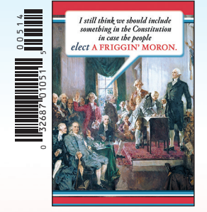
BDT40093101 "I still think we should include something... in case the people elect a... moron." Your birthday constitutes a celebration! Happy Birthday—Dare to Laugh™ $3.95