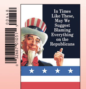
BDT40148801 ...may we suggest blaming everything on the Republicans You're another year older... Damn that White House! Happy Birthday—Dare to Laugh™ SV $3.95