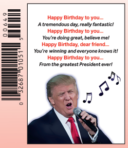
BDT40149501 Happy Birthday to you... really fantastic! ... You're doing great.... From the greatest president ever! Making your birthday great again!-G & C Studio $3.95