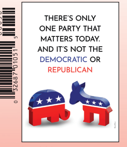
BDT40149601 There's only one Party that matters today. And it's not the Democratic or Republican. It's yours! Happy Birthday—G & C Studio SV $3.95