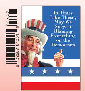
BDT40148701 ...may we suggest blaming everything on the Democrats You're another year older... Damn that White House! Happy Birthday—Dare to Laugh™ SV $3.95