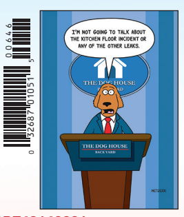
BDT40148601 "I'm not going to talk about the Kitchen Floor Incident or any of the other leaks." It's your birthday, alert the Fake Media! Happy Birthday—Dare to Laugh™ SV $3.95